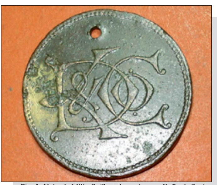
Fig. 3. Uplands Mills Coffee token, obverse K. D. & Co. in monogram within a beaded circle (Anslem de Silva collection).

The measurements of the shell were: curved carapace length 136 cm, curved carapace width 133 cm and the shell height 49 cm. Vertebrals 5, nuchal is absent, cos-