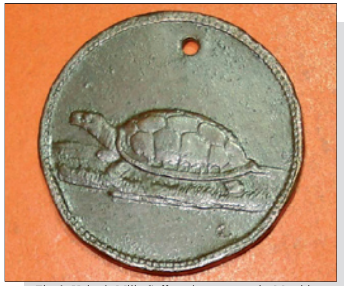
Fig. 2. Uplands Mills Coffee token, reverse the Mauritius giant tortoise.

news report states that this tortoise had lived at Uplands compound for 150 to 200 years. The news report adds that the tortoise got rid of seven men sitting on it