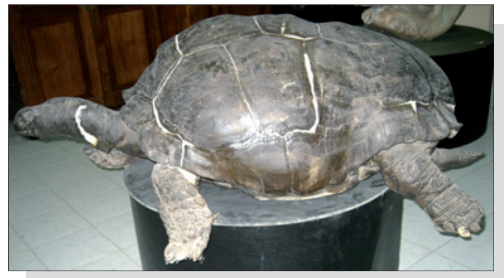
Fig. 1. Mauritius giant tortoise (Cylindraspis inepta), Colombo National Museum.

tortoise (possibly Cylindraspis inepta GÜNTHER, 1873) had been brought by the Dutch from Mauritius during the Dutch Period (this is a term used synonymously for the period, and the area of Ceylon or Sri Lanka that was controlled by the Dutch from 1685-1796). According to Ferguson (1877), this tortoise had been at Uplands, Mutwal (near Colombo) for 150 years. FERGUSON (1877) further reports of an interesting account of this tortoise which had appeared in the Ceylon Observer of 25 April, 1870, that one C.E.H. Symons had exhibited this tortoise at an exhibition organized for the Duke of Edinburgh when he visited Ceylon (Sri Lanka), further the